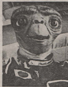
Invader... the take E.T.

He insisted: "We did nothing wrong. We thought everyone would be asleep at that time."