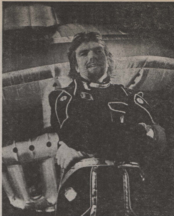
Spaceman Branson... outside his capsule

"I thought the little green men were coming. I ran out in a panic